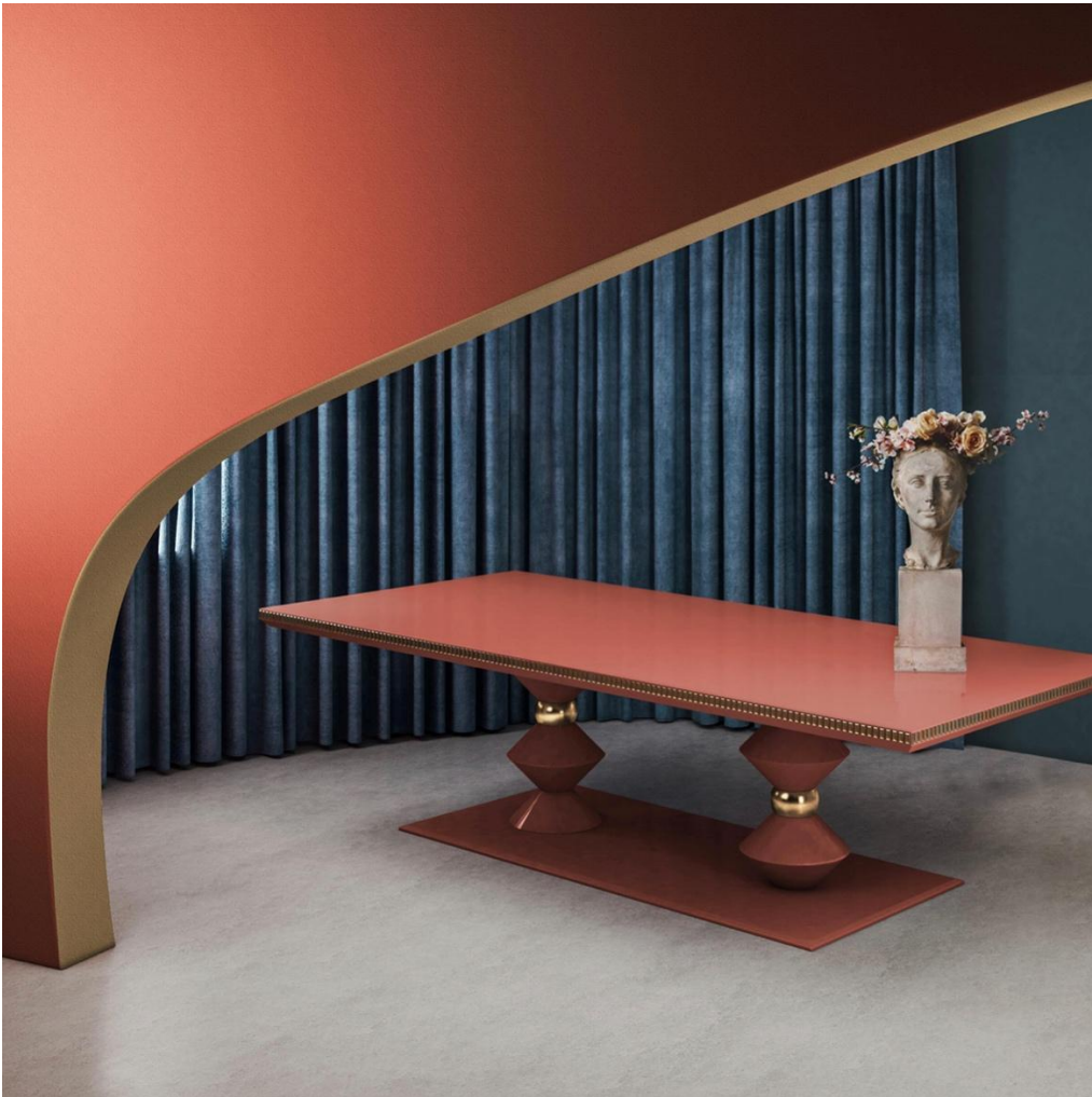
Luis Carmona – August 20, 2022

Decorative lacquerware has been used in cultures for thousands of years. Japanese lacquer, or Urushi, comes from the sap of the Urushi Tree, also known as the Lacquer Tree . The sap goes through a vigorous process that results in the transparent, viscous, honey textured lacquer. Not so fun fact, the liquid sap from the Urushi tree, in its raw form, is quite poisonous and even breathing in the fumes can be dangerous.